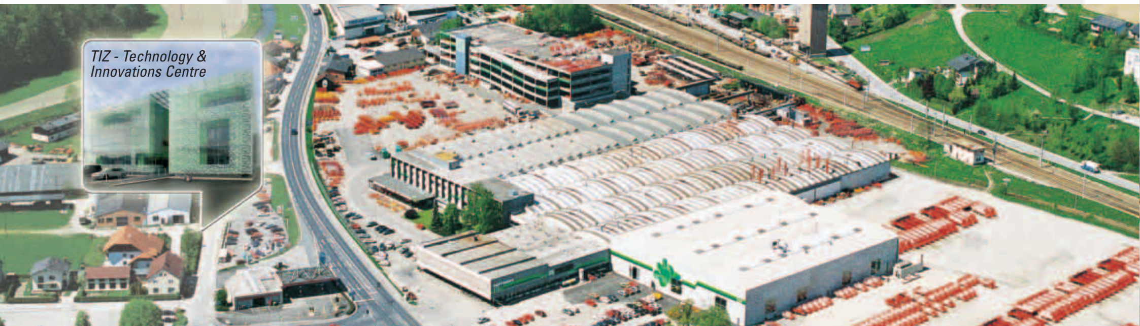
TIZ - Technology & Innovations Centre